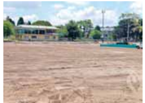
A total redevelopment of Croydon Oval is currently underway, including new drainage, irrigation and playing surface.

New coach's boxes and fencing around the oval have also been installed.