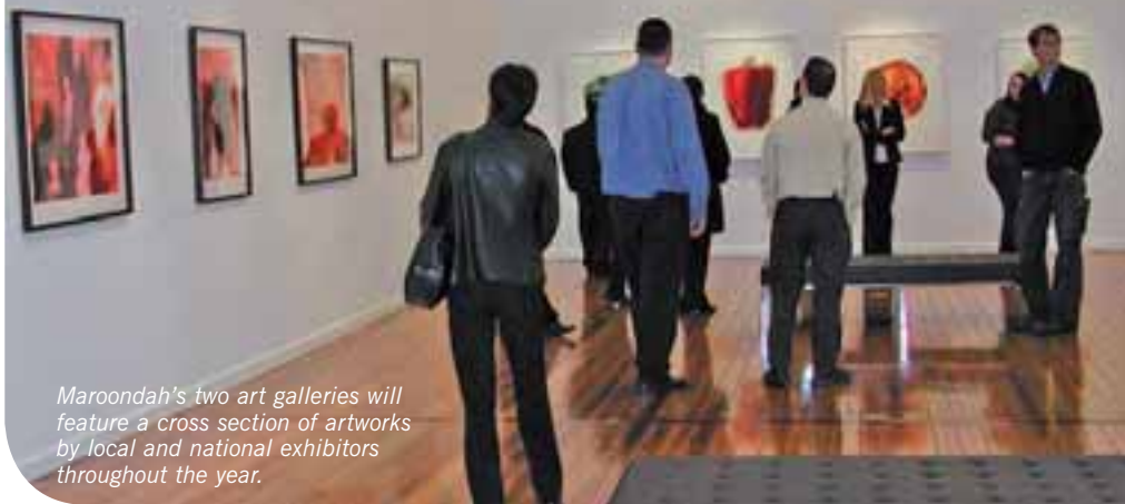
Maroondah's two art galleries will feature a cross section of artworks by local and national exhibitors throughout the year.

The highlight of the year will be the $25,000 R&M McGivern Art Prize which