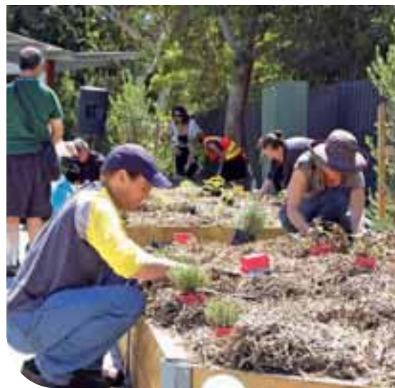
A planting day with local residents was organised as part of the official opening of Larissa Park.

Council will soon be consulting with the community as to the proposed elements to be considered as part of the park design.