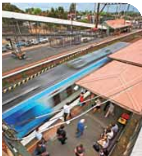
Ringwood Station and bus interchange will be transformed into a safer, more accessible and attractive place for residents and visitors to Maroondah.

The State Government will now review all of the feedback before developing a final concept design.