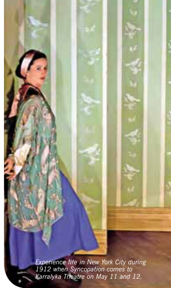
Experience life in New York City during 1912 when Syncopation comes to Karralyka Theatre on May 11 and 12.

For a full Karralyka Theatre program visit www.karralyka.com.au or pick up a program at the venue or one of Council's Service Centres.