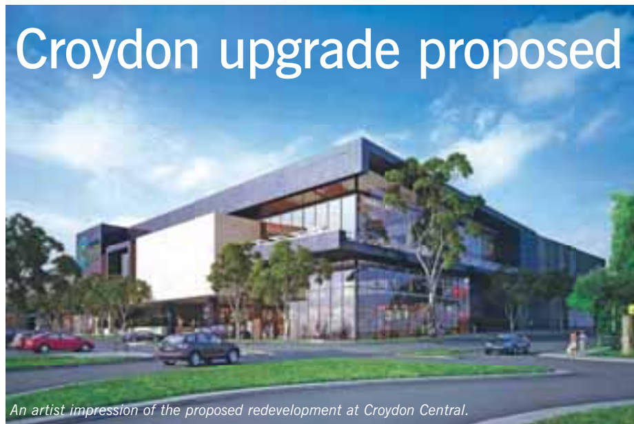
An artist impression of the proposed redevelopment at Croydon Central.

A multi-million redevelopment of the Croydon Central Shopping Centre is one step closer, with Council recently receiving a planning application for the site.