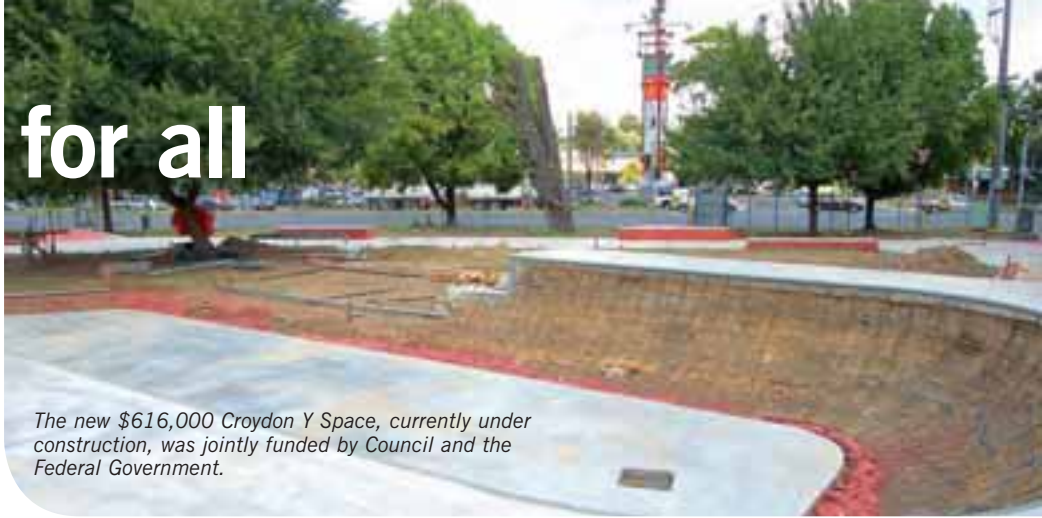
The new $616,000 Croydon Y Space, currently under construction, was jointly funded by Council and the Federal Government.

A major highlight of the facility will be the 1100m 2 skate area catering for skateboarders, scooters and BMX riders. The area includes a street plaza, mini ramps and open ended bowl which will greatly improve on the previous facilities in Croydon.