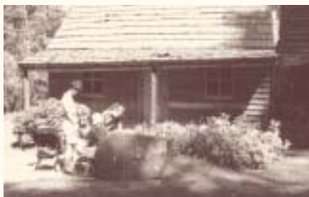
Miner's Cottage, part of Maroondah's antimony history