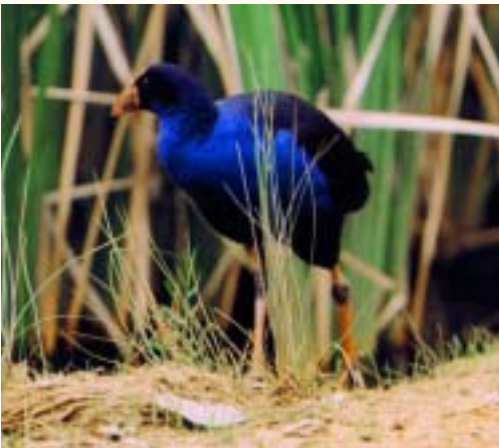
Purple Swamp Hen at Croydon Park

1 Start at Croydon Lake and walk up Mt Dandenong Road under the railway bridge. ( Railway gates when Railway built in 1882. )