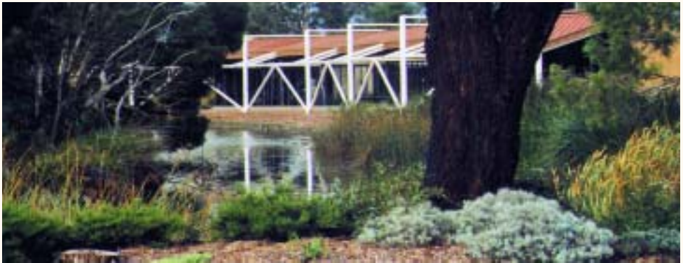
Croydon Lake and Library, opened in 1981

Level of Accessibility Moderate – Footpaths with moderate grades and road crossings