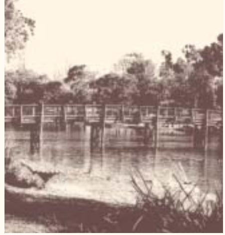
Ringwood Lake, originally Sandy Gully Creek