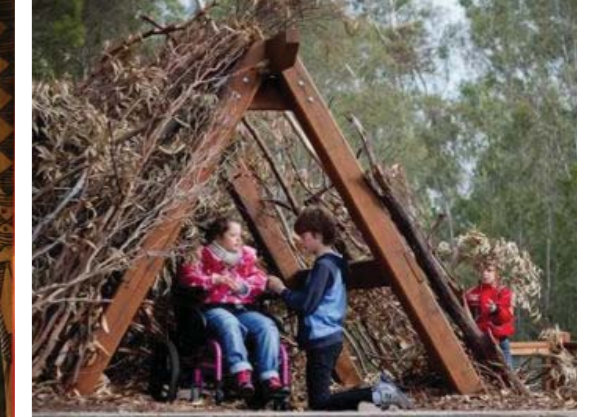
Exploring and discovering hidden treasures