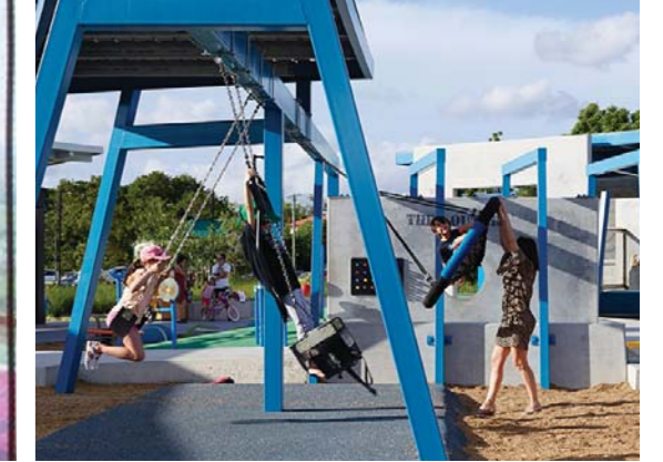
Getting from A-B without touching the ground