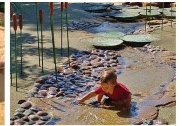
Splash and build with water, sand and rocks