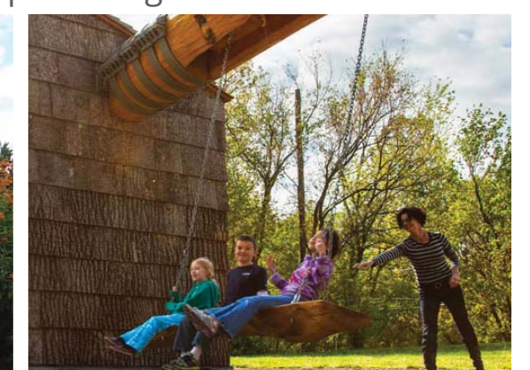
Relax, play and explore playful places together