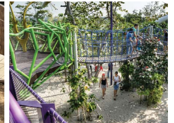
Playing up high in the tree-tops