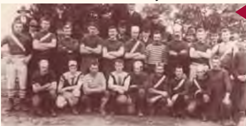
Early 1900 football team