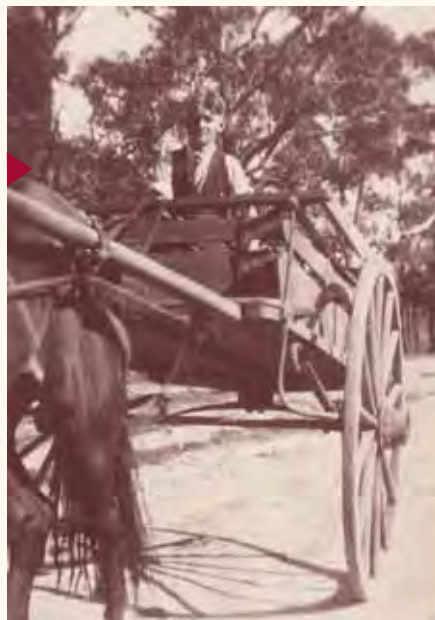
Bread delivery from Herry's Bakery, Ringwood East