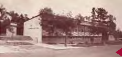
St Francis de Sales Catholic School