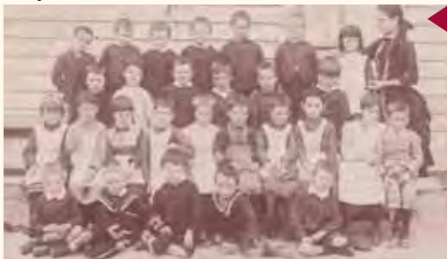
A class from Cass' School