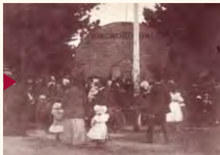
Ringwood Miner's Hall