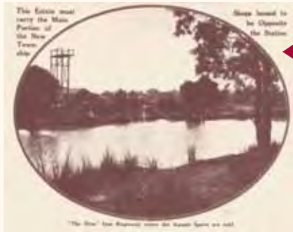
Knaith Road Swimming Pool