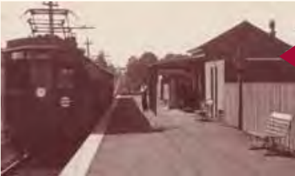
Ringwood East Railway Station