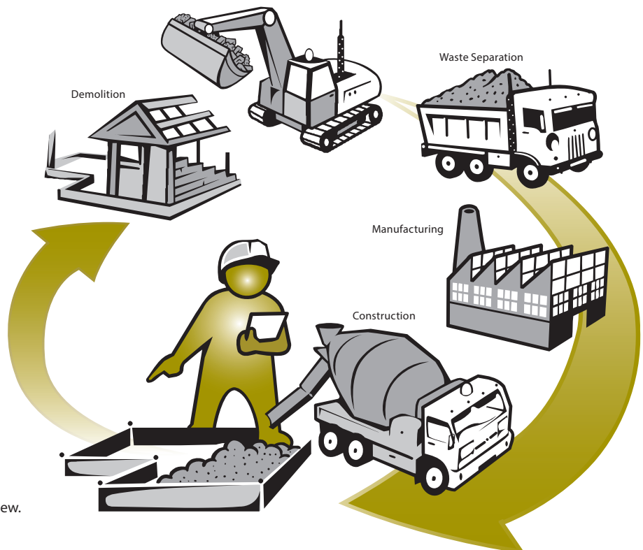
Consider recycling when demolishing and building new.

When specifying timber, ensure that it is certified through an accredited forest certification scheme such as the Forest Stewardship Council (FSC), or the Australian Forest Certification Scheme (AFCS).