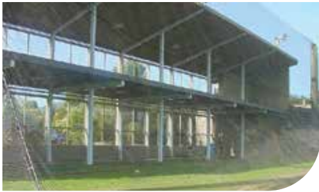
Archival image of the former double storey driving range at Dorset Golf.

Around 2 million people have played at Dorset Golf since it first opened its doors, with a record 84,257 rounds of golf played in 2024.