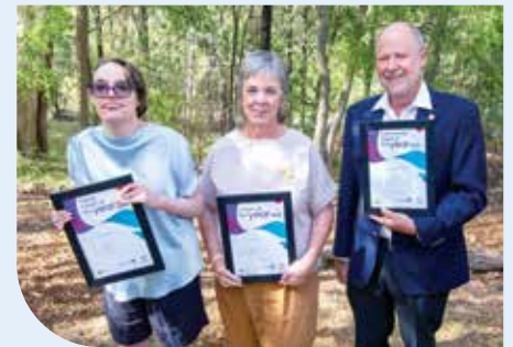
2025 Maroondah Australia Day Award recipients.