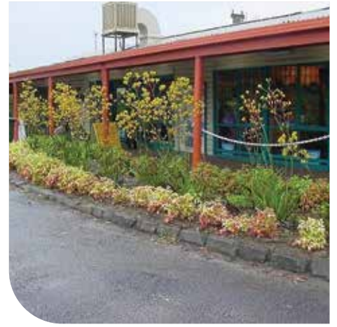
Archival image of the entrance to the golf shop.

Play casually or with a membership, whatever suits you best!