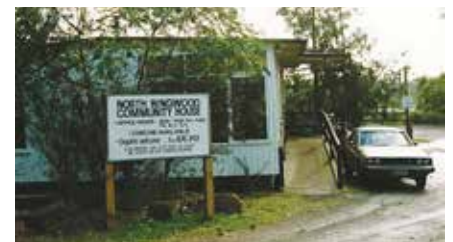
Historical image.

To learn more, visit the North Ringwood Community House website www.nrch.org.au