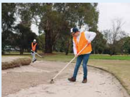
Volunteers assisting with raking bunkers.

The program has been facilitated by Council and Onemda, a disability