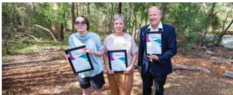
2025 Maroondah Australia Day Award recipients.