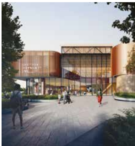
Artist impression of CCWP Cultural Hub

Early works have started onsite to build the Cultural Hub as part of the Croydon Community Wellbeing Precinct (CCWP) project. Hoarding is up to allow for site preparation and demolition works.