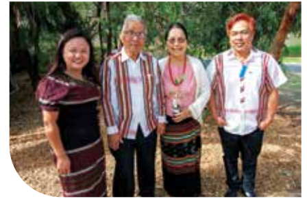
Maroondah residents following the citizenship ceremony