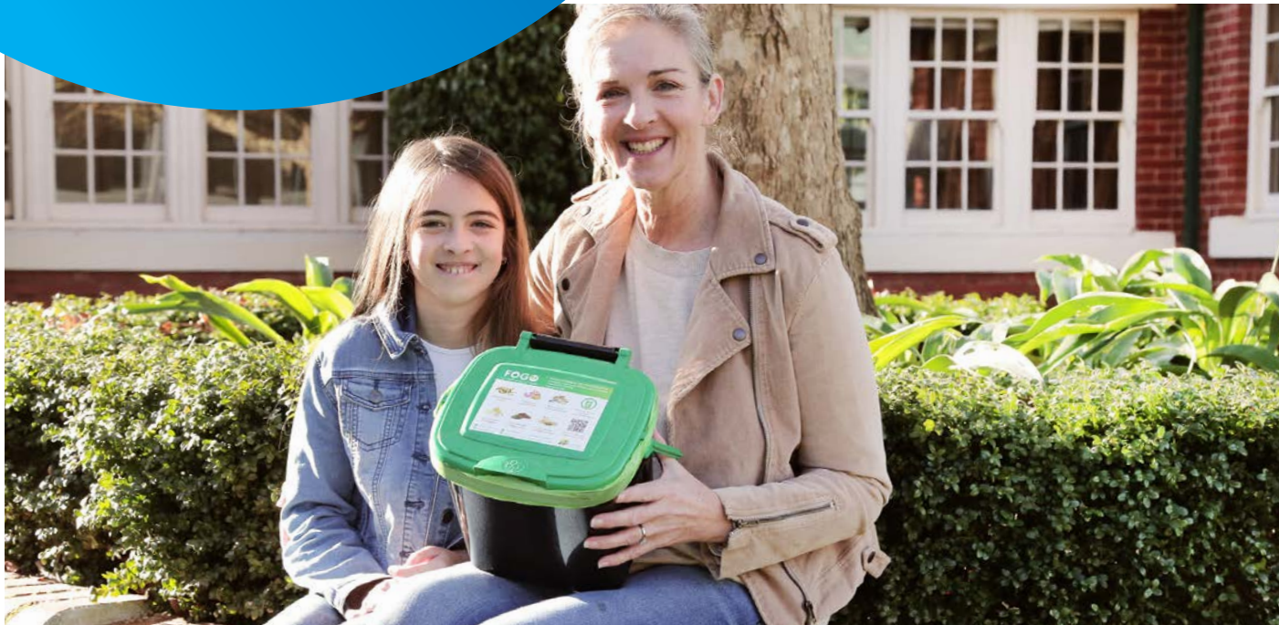
Our FOGO champions are excited that the FOGO service has officially launched.