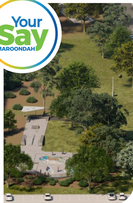
Staley Gardens, Ringwood

Share your thoughts via Council's Your Say Maroondah website: www.yoursay.maroondah.vic.gov.au