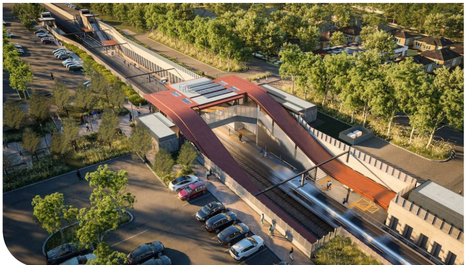
Looking west at the new Ringwood East Station. Artist impression, subject to change.

For more information, visit the Victoria's Big Build website at bigbuild.vic.gov.au/projects/level-crossing-removal-project