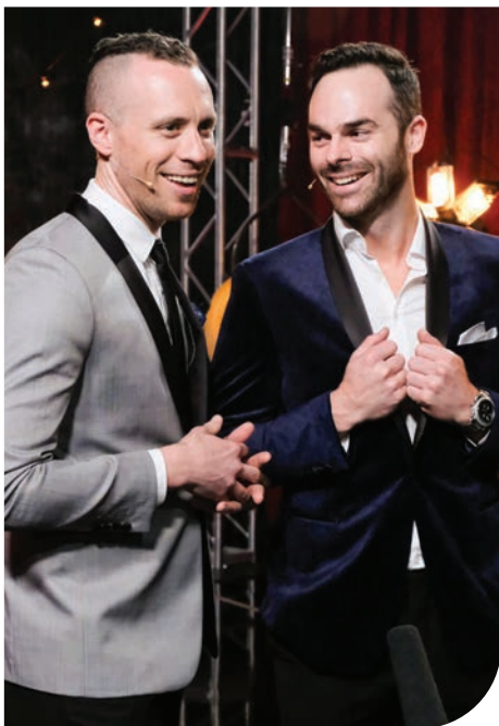
The Naked Magicians