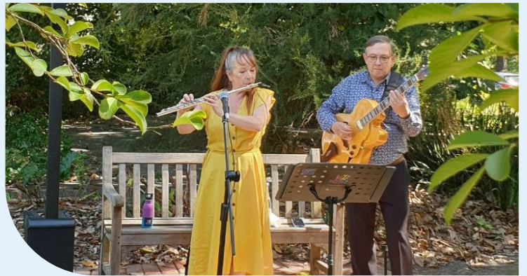
2021/22 grant recipients Jazz Notes produced Jazz at the Lake at Ringwood Lake Park with support from Council's funding program.

Artists, arts and cultural groups and organisations are invited to apply for a share in funding to support their projects through Council's Arts and Cultural Grant Funding Program for 2023/24.