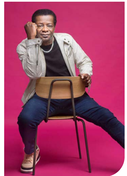
Stephen K Amos: Before and Laughter

Maroondah City Council is committed to providing equitable service to all in our community.