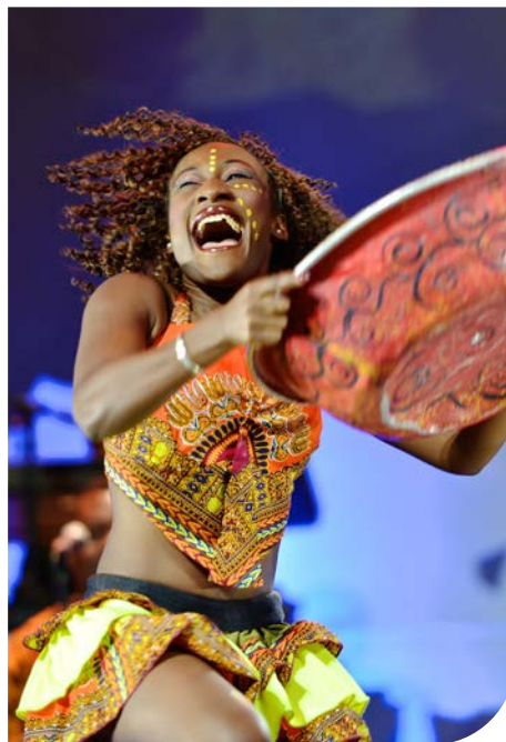
Cirque Mother Africa