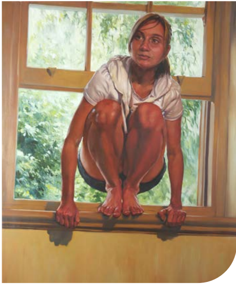
Claire Bridge, The Escape , 2009, oil on linen, Maroondah City Council Art Collection