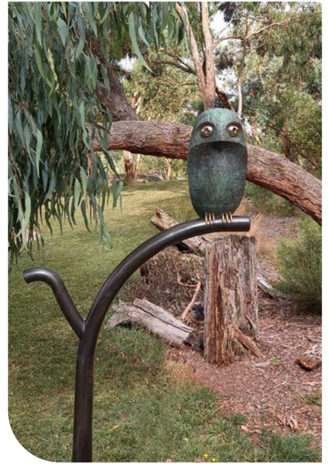
Alexander Knox: Da Ancient One 2023 stainless steel, bronze and concrete.

Da Ancient One is now a full-time resident at Melview Reserve, in Melview Drive, Ringwood North.