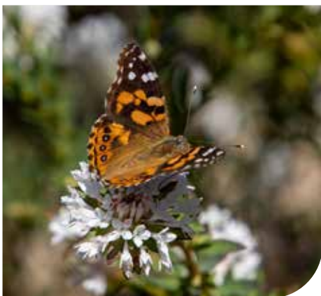
Australian Painted Lady ( Vanessa kershawi ) butterfly by Suzanne B

Australia is home to thousands of species of pollinators, including native bees, flies, wasps, beetles, moths, butterflies, birds, bats and small mammals, that transfer pollen and help plants develop seeds and fruit.