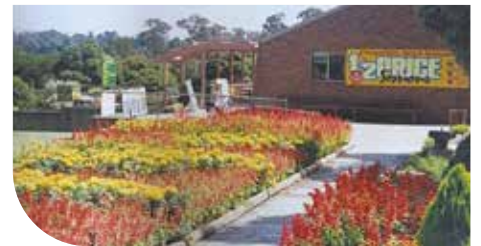
Archival image of the flower garden at Ringwood Golf

Visit the Maroondah Leisure website www.maroondahleisure.com.au for updates on celebrations to mark 50 years of Ringwood Golf.