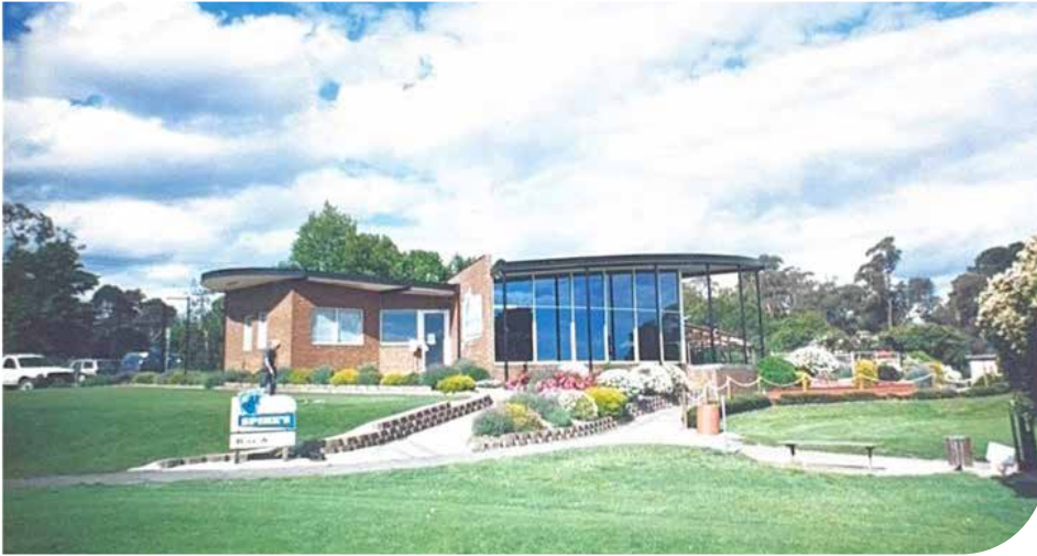
Archival image of Ringwood Golf from the 18th hole, around the late 1990s.

Ringwood Golf celebrates a milestone 50 years this month, having opened on 30 March 1974.