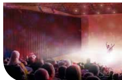
Artist impression of a Blackbox, which will be a key feature of the new Croydon Community Wellbeing Precinct.