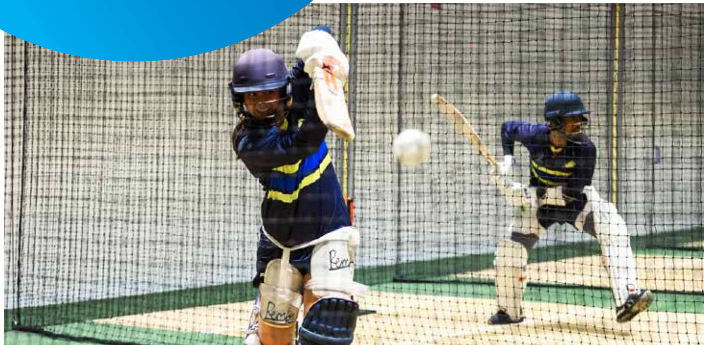
Maroondah cricketers training at the new Maroondah Edge centre, which opened for use last month.