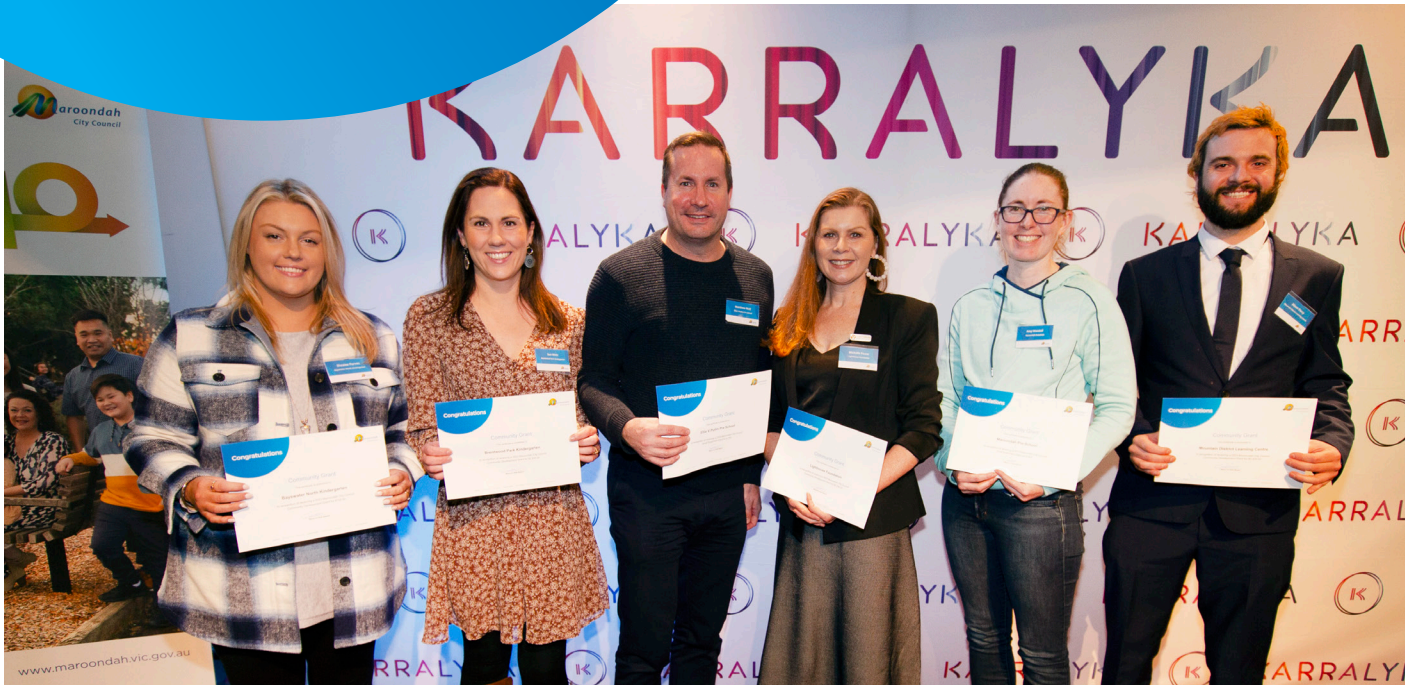
Some of our 2023/24 Community Grants beneficiaries, who were celebrated at an event last month.