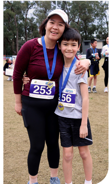
Participants from last year's Run Maroondah event.