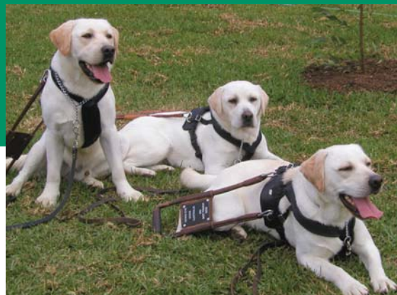
Assistance Dogs in Harnesses