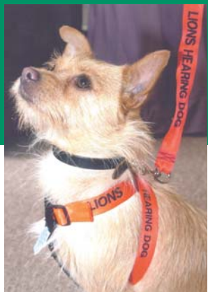
Assistance Dog in Harness

Although many Victorians are generous in providing open access to people accompanied by their assistance dog, not everyone is aware of their legal obligation. The rights of a person accompanied by an assistance dog are covered under the Domestic Animals Act 1994 and the Disability Discrimination Act 1992 both these acts override the Food Act 1984 which prohibits dogs from entering food premises.