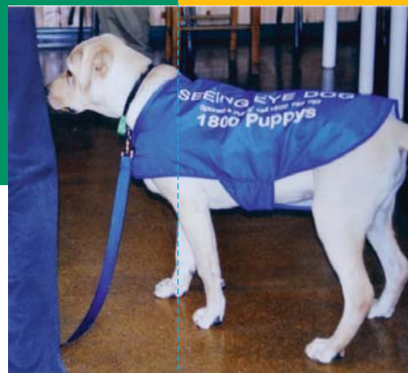
Assistance Dog in Training