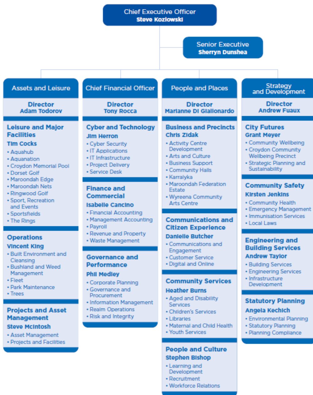
Figure 2: Organisational structure of Maroondah City Council

Council operates administrative functions from the following main locations: