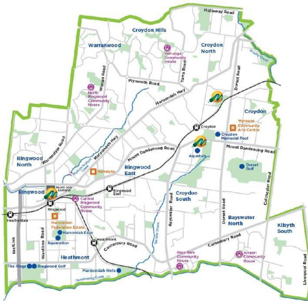
Figure 1: Boundary map of the City of Maroondah