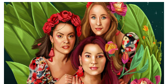
Queen of Hearts Mariachi Band