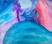
YourDNA Creative Arts (pictured: Alina Ajajas)